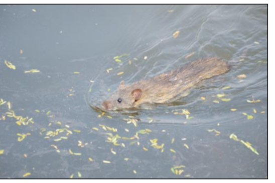
Rats (and mice) are strong swimmers and climbers. Next month we'll bring you some tips on how to keep your vessel pest free.

Rats can squeeze through a 12mm gap and mice through a 7mm gap. Insects could hide in your bag, and weeds, seeds and soil could cling to your clothing