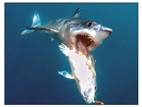
Makos will jump high and have landed in boats, so if you hook one, be prepared.

When faced with the scenario of sharks devouring your catch before it reaches the boat, it's prudent to relocate to a different fishing spot. This not only prevents further depletion of your catch but also reduces the risk of attracting more sharks to the area, which could potentially lead to unsafe conditions for