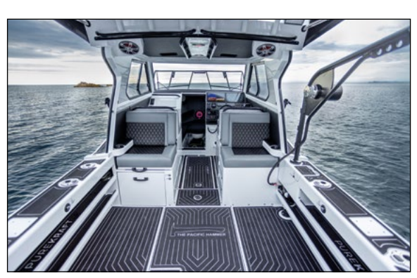
Seadek provides an attractive non-slip flooring through-out.

Speaking of keeping things cold, this 800 HT was also fitted with an innovative air-conditioning system. It gets hot in California, so as well as side windows, and roof vents to help with air flow, a small air-conditioning system blows cool air up into the back of the seat, with a vent at the helm blowing cold air in the direction of the skipper. Extra ventilation comes in the form of sliding side windows, as well as roof hatches above.