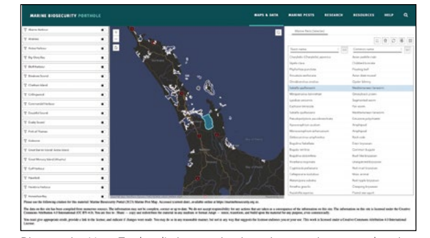
Biosecurity New Zealand's interactive invasive species map showing the detection of Mediterranean fanworm in the Firth of Thames.

A marine map (see accompanying image) has been created displaying which non-indigenous marine species are present within the main ports and