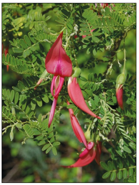
Kakabeak is part of Motuihe Island's endangered plant project.

The Gulf's pest-free conservation islands are a safe haven for rare and endangered plants and animals, the last remaining hope for the survival of some endemic species whose mainland habitats are destroyed or predator-ridden. Minimising human impacts on these sanctuaries and keeping them pest-free is essential.