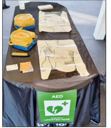
AEDs come with excellent and straight-forward instructions for use, so that even someone with no training can use one to save a life.

Advanced technology means St John's modern training equipment can measure the effectiveness of the CPR being given.