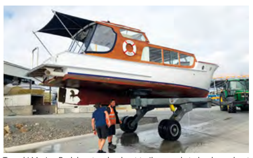
Undercover hardstand storage options are also available.