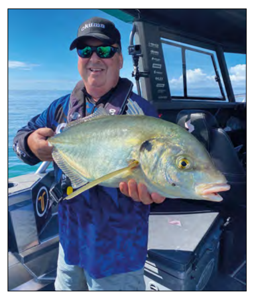
Hard fighting trevally can be found around structure in winter.