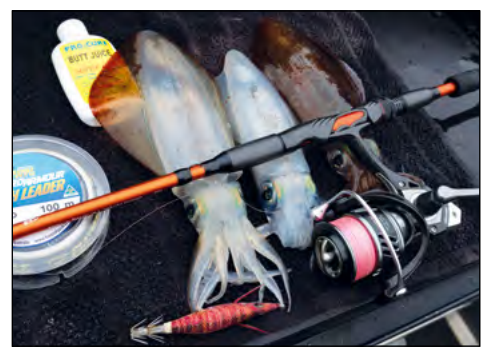
Squid fishing is good in winter and squid make great fresh bait or delicious dinner.

Winter is an excellent time to target gurnard and trevally. They often inhabit sandy or muddy areas, so focus your efforts near coastal beaches, sandbanks, or shellfish beds. These species are prolific in the west coast harbours like the Manukau and Kaipara. Oily salted bonito, squid, or pilchard fillet baits work well when presented on a flasher or dropper rig. Gurnard and trevally are attracted to scent and burley. Create a burley trail by periodically dropping small amounts of chopped pilchards or shellfish into the water near your fishing spot, to