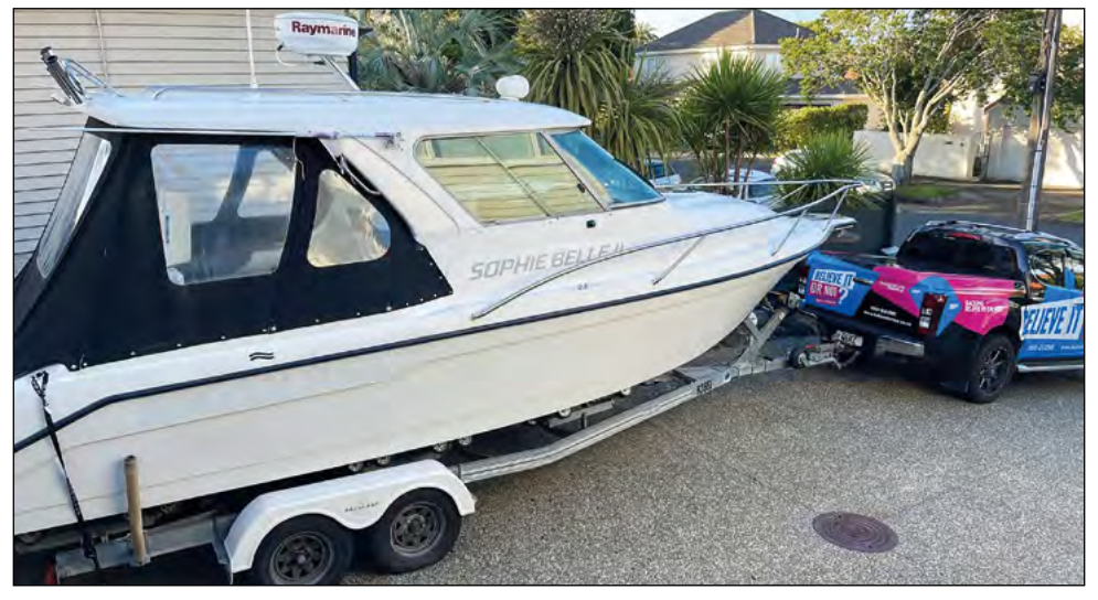
Originally petrol-powered, Sophie Belle II now has a Mercruiser 2.6 turbo diesel after a wee mishap flooded her former engine.