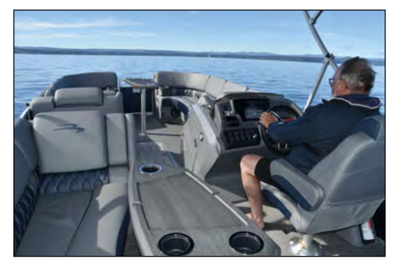
Floor plan and seating options mean there's a Bennington 25 QSB for everyone

Bennington's bold, forward-thinking design puts the pontoon boat on a whole new level of acceptance. It combines the best of a pontoon boat and the most coveted attributes of a fibreglass bowrider. Graig admits that it will take some time