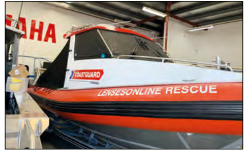
Five months after it was damaged by a landslide, Coastguard's LensesOnline Rescue is nearly ready to go back in the water.

The past few months have been demanding for our small unit, but the outpouring of support from the community has been truly heart-warming. We are grateful for all the assistance we have received, which has played a crucial role in getting us back on the water and serving our community once again.