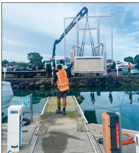
New gangways being installed on C and D piers.

More people are using the OBC side of the road now, due to the work on the northern side. Please be extra careful