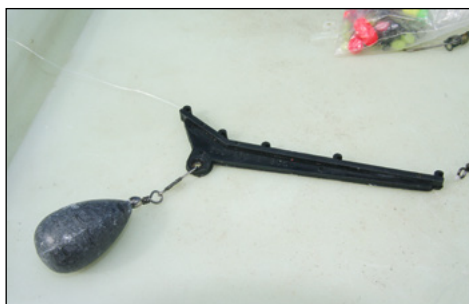
Sinker booms are great for channel fishing in current