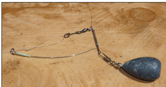
The difference between booms (pictured) and sinker sliders is, booms fish at right angles.

A sinker boom helps to maintain a consistent depth, which is essential when targeting bottom-dwelling fish. By attaching the weight to the boom, the angler can ensure that the bait is constantly in contact with the bottom, where these fish are likely to be feeding. This is particularly important in deeper water, where it can be challenging to maintain a consistent depth with a traditional rig.