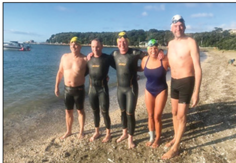
Tired but happy swimmers on the beach at Okahu Bay.

The route took support boats, kayak and swimmers out into the busy Motuihe Channel, keeping to the left and passing close to the reef extending from the island. Heading southwest in the Motukorea Channel, west of Browns Island, aiming for Saint Heliers beach and, hopefully, calmer water sheltered from the south westerly wind. From there it was a westerly track along the bays to eventually pass under the