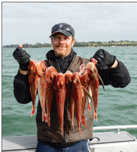
Sliders and booms work well when targeting bottom feeding fish.

A sinker boom is a rig that consists of a wire or plastic piece of terminal tackle that has a weight attached to one end, and a swivel on the other end which connects to the main line and leader. This rig allows the angler to keep the bait close to the bottom while minimising the risk of snags and tangles.