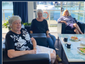
A few of the ladies who gathered for the International Women's Day morning tea at the Club.

Wednesday March 8, was International Women's Day, and the Club decided to host a special morning tea in the clubhouse, inviting all the ladies of the OBC. Morning tea