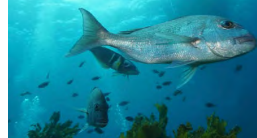
The west coast snapper population has rebuilt after decades of overfishing. Sign the petition at haurakigulfalliance.nz/petition to support the removal of bottom contact fishing methods from our inshore waters.

If we removed bottom trawling and scallop dredging, seabed communities could regrow and snapper and other species