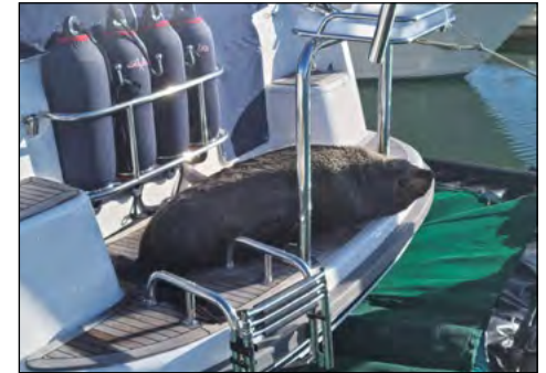
A New Zealand fur seal making himself comfortable on a boat in the OBC Marina. Just waiting for a coffee and a copy of the Outboarder.

pages. And that's it, you'll be in the running. Photos will be posted on OBC social media, and selected images will also appear in the Outboarder magazine during the course of the competition. Competition closes on December 31, 2022.