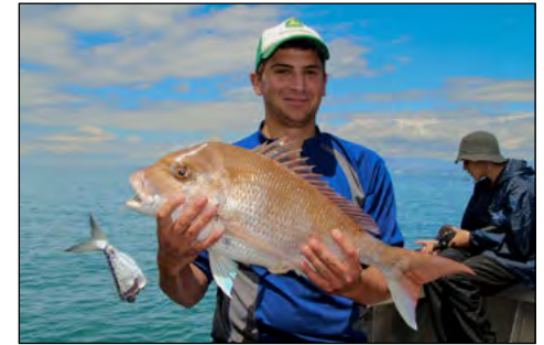
Snapper will make the most of mussel harvesting time, and so can you.

Boat positioning is very important when fishing farms. You want to anchor so that your burley will drift into the structure and you do need to get quite close. Electric