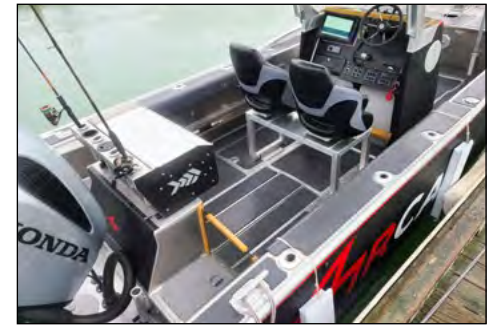
The cockpit sole and decks are covered in Nano Grip Steel Grey from U-Deck.

On the performance side, the 200hp Honda is controlled by Fly by Wire and linked to a Garmin i20 display. Top speed is in the mid 40 knots. Fuel is 220 litres in two