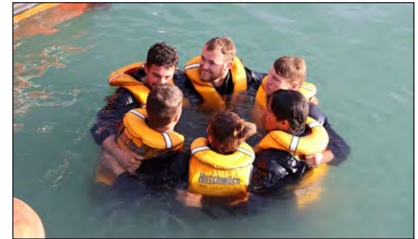
The 'wet drill' is part of Coastguard's in-water survival course.

For more information about Coastguard Boating Education's in-water survival course, contact the team on 0800 40 80 90 or email info@boatingeducation.org.nz