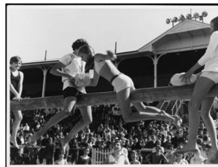
Above > Teens take on the challenge of the slippery spar.

As usual, the pool was the major attraction the following year, although its capacity was only five million gallons - it still took four and a half weeks to fill at 10,000 gallons an hour.