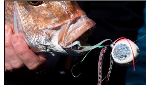
Pay attention to the weight of slider heads and vary to suit depth and drift. It pays to stay on the heavy side if you are not sure.

The tackle you use to fish a slider will make a difference to how successful your catches are. If you are one of those anglers who puts on a slider and puts it in the rod holder as your technique this is fine, because it does work. If you want to be a more active angler and enjoy more bites and hook ups, try fishing your slider on a very light rod about 2m-plus in length, with very light braid and a 6kg-10kg leader. The technique is to drop the lure to the bottom, keeping it as vertical as possible, and once on the bottom start a very slow retrieve - usually about one wind per second. Do this until you wind maybe halfway to the surface. Then drop it down and repeat. If you get too much angle on your line, wind in and start again. If, when slowly retrieving, you get a touch, don't strike, just keep retrieving until the rod loads up and the fish is hooked. Lightweight overhead reels are