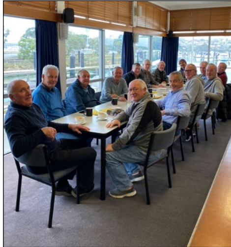
A record turnout for July's members' morning tea.

The members' morning tea happens on the first Wednesday of each month - August 3 is the next one, and it is a great chance to mingle and meet other members. Rumour has it there is also quite a gathering Saturday mornings around 10.00am, so whichever day suits best (or even both), feel free to join in on the action. Boating and fishing talk mandatory!