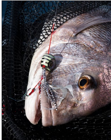
Snapper respond really well to sliders when they are schooling. This one is a Savage Cuttle Eye.

or high current situations. The paint work on the heads will also vary in quality from poor to very good, with the best lures having long lasting paint with the addition of UV and glow - which add to the fish catching benefits of the lure. The final thing to look for in a slider head is the balance. Cheap models will tumble when dropping, whereas good quality heads will fall without tumbling.