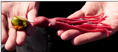
Tungsten heads are a great advancement in slider technology. The larger skirt is good when the big fish are on the chew.

The better quality sliders will feature a head that is made from various materials with the best being tungsten, which gives the slider more weight than others for less physical size. This aids with getting sliders down quickly, especially in windy