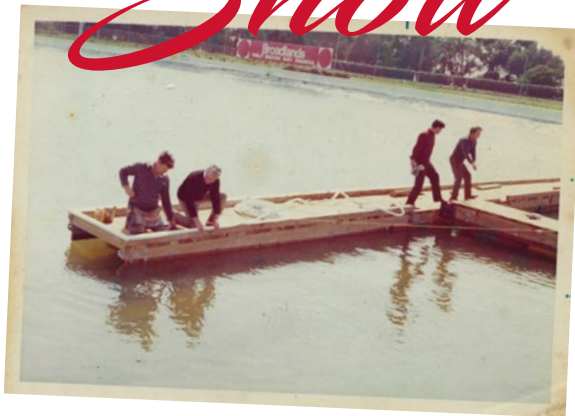
Volunteers build a temporary floating jetty in the pool at the Epsom showgrounds.

For the OBC, it all began in June 1957, when the fledgling and near-penniless Club was scratching around for fundraising ideas. The suggestion of a boat show, presented at that June's committee meeting, developed into perhaps the most exciting event in the Club's early history, and the money-spinner that put the OBC on its feet. The Club's first show was held in November 1958, on the ground floor of the Farmers Trading Company carpark