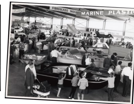
Right > Crowds view the boats on display at the 1968 show.

On- and in-water action included 'M' class yacht racing, mini-hydros, water-ski displays (by humans and a chimpanzee), jet boat races, a kids pirate ship and slippery spar competition. Land-based activities offered a teenage disco and "sophisticated evening entertainment for the adults". There were also raffles, the Miss Boat Show feature, and a large display of yachts and boats.