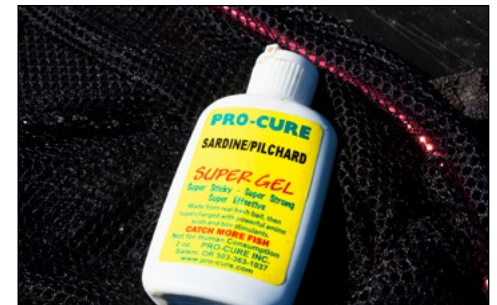
Adding a spot of attractive scent is a great way to enhance a slider.

best for this style of fishing as they provide better contact with the lure when dropping and retrieving.