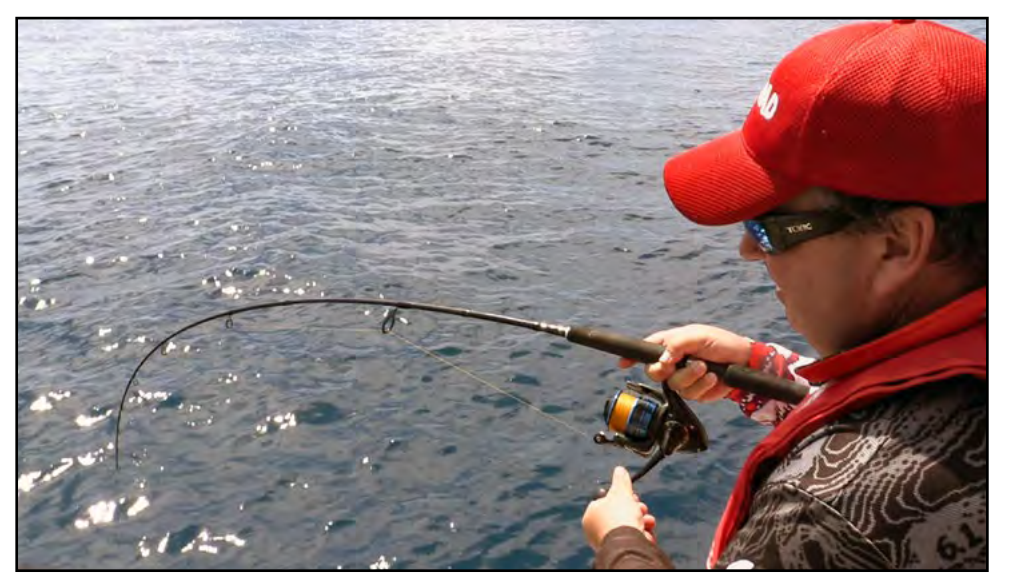
Do you ever worry about having enough line?

Things like stiffness, abrasion resistance, diameter, and knot strength are other factors to take into account, and decisions will be based on the type of fishing you do. For example, if you fish big baits around rocks and foul, a good abrasion-resistant line will be great. Alternatively, if casting distance and low ...Continued on page 18