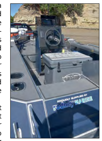
A 72 litre Icy-Tek bin provides both seating for two and storage, plus comes with a fish measure set into the faux teak.

The centre console comes complete with a screen, which provides protection for the Garmin 9-inch MFD. The facia offers plenty of space for switches and instruments. We had a Yamaha engine management display, a switch panel and USB port. A GME G-Phone was mounted below the console, where there are also a couple of deep storage trays.