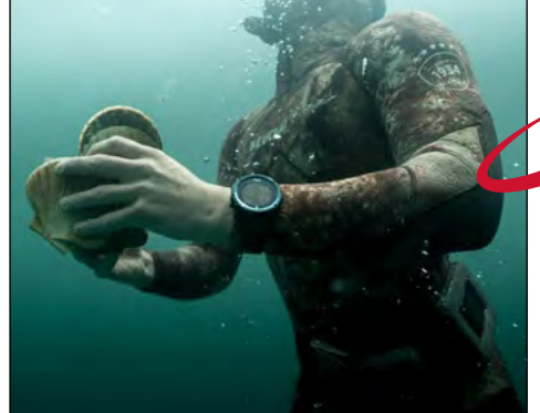
Hope is rising for the rebuild of the Gulf scallop populations.