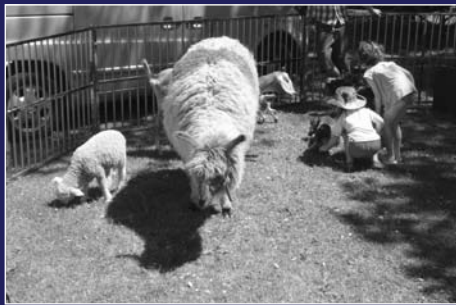
Old MacDonald's Farm was a special treat. We could even pet some real live farm animals.

of the kids asked if they could bring reindeer next year as they haven't seen a real one yet! A very big thank you to the promotions committee for a great afternoon.