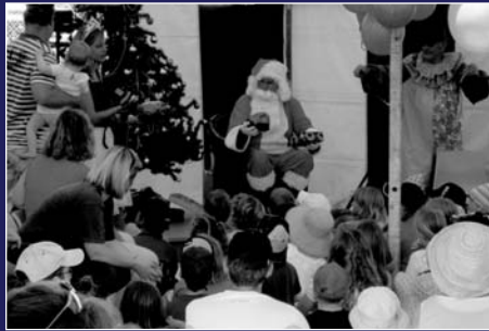
Santa was kept busy dishing out presents to all the good boys and girls.